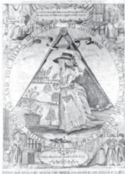
Keep within Compass (English, laid paper, 1785-1805) Winterthur Museum (54.93.1)